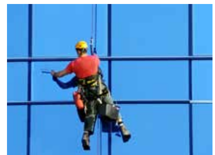
BUILDING CLEANING SERVICES