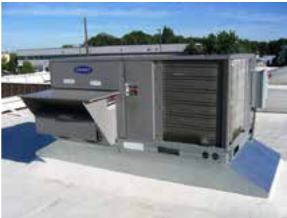
AIR-CONDITIONING AND VENTILATION SYSTEMS

Catalyst has a well-established Maintenance Division with dedicated efficient, qualified and well-experienced team of Engineers, Supervisors, Technicians and Skilled workers with adequate transportation and communication facilities. Training programs are periodically arranged for the technical team to create an awareness of the latest technologies in the market.