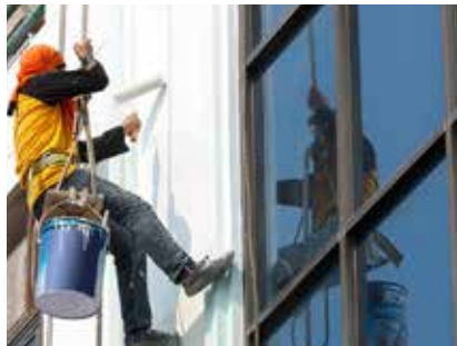
CIVIL & PAINTING WORKS