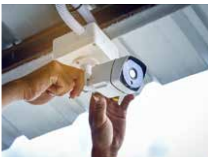
SECURITY SYSTEMS: CCTV, ELV SYSTEMS, GATE BARRIER & AUTOMATIC SLIDE DOORS