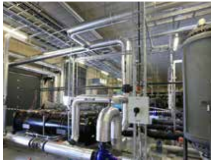
DISTRICT COOLING PLANTS