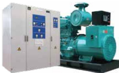
GENERATOR / UPS SYSTEMS